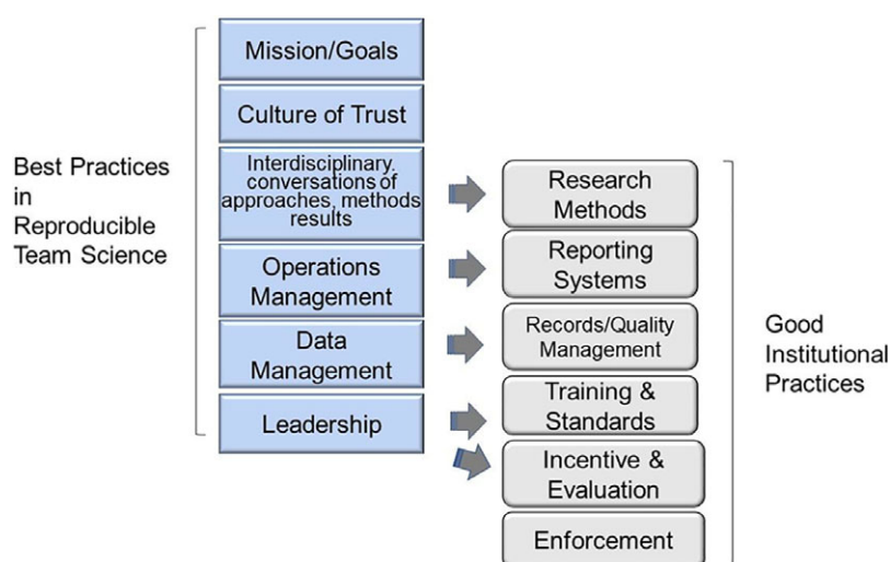
Fig. 2. Best practices in reproducible team science support the culture of good institutional practices (GIPs). Mapping the best practices in reproducible team science with the six GIPs proposed by Begley et al.

psychologically safe environment, leadership listens to all voices, encouraging all team members to participate in a meaningful way. Team members learn to share failures, ask questions, and challenge the assumptions of others, in a respectful way that encourages open discussion and debate and discourages personal attacks. Team members meet their commitments and trust colleagues to do the same.